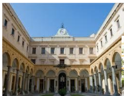
Di.Gi. Law Department