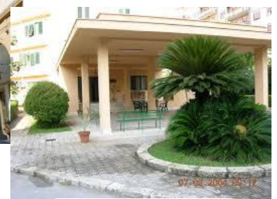
Istituto P. Arrupe